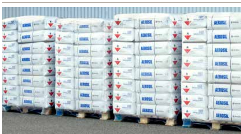
Figure 7 Storing of special, surface-treated types of AEROSIL® with sufficient spacing between pallets

Palletized goods and FIBC units must not be exposed to direct sunlight (choose shaded areas), since external energy input will be conducive to the oxidation process and increase the temperature on the product.