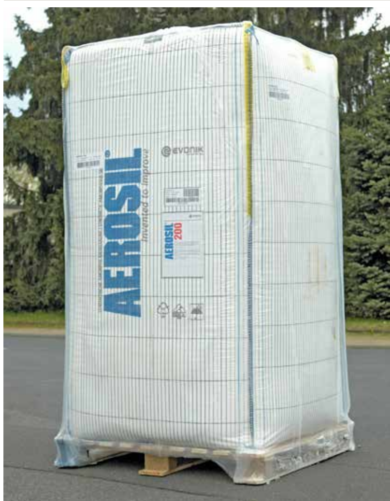
Figure 2 Shipment of AEROSIL® in FIBC