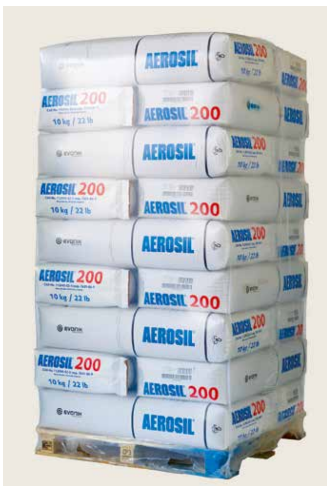
Figure 1 Shipment of AEROSIL® in bags

AEROSIL® is delivered in different types of packaging, such as bags and semi-bulk packaging, and in bulk by silo trucks (Figures 1, 2, and 3). Although bags and semi-bulk packaging types are protected by secondary packaging, such as polyethylene shrink or stretch wrapping, you should store AEROSIL® in a dry, roofed place. Furthermore, paper bags and FIBCs lose their primary moisture protection if the shrink wrap is removed. You should keep this in mind when storing pallet stacks that have already been opened. When designing your warehouse layout for products that come in bags or semi-bulk packaging, store them under the conditions described below. The same goes for bulk storage.