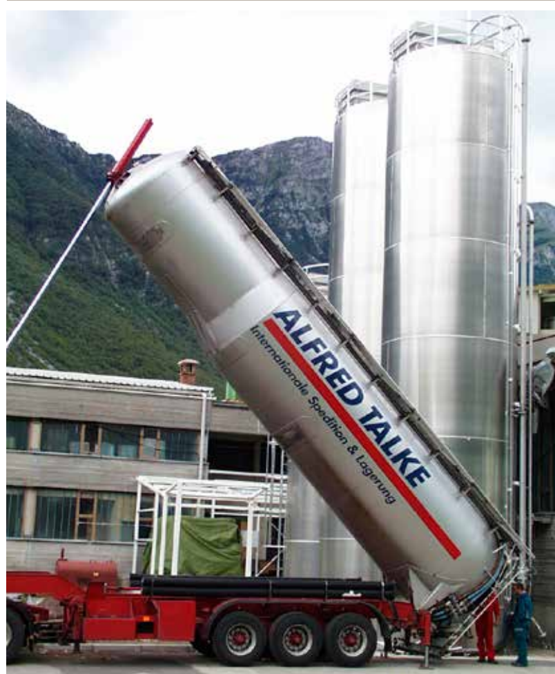
Figure 5 Storage of AEROSIL® in a storage silo

The most commonly used materials for building silos are aluminum alloys such as AlMg3 or stainless steel 1.4571 (in exceptional cases 1.4301, too). If regular steel is used, the silos should be provided with an internal coating to protect them against corrosion. Coatings have the disadvantage, however, that they need to be checked regularly to see what condition they are in and need to be reapplied if necessary.