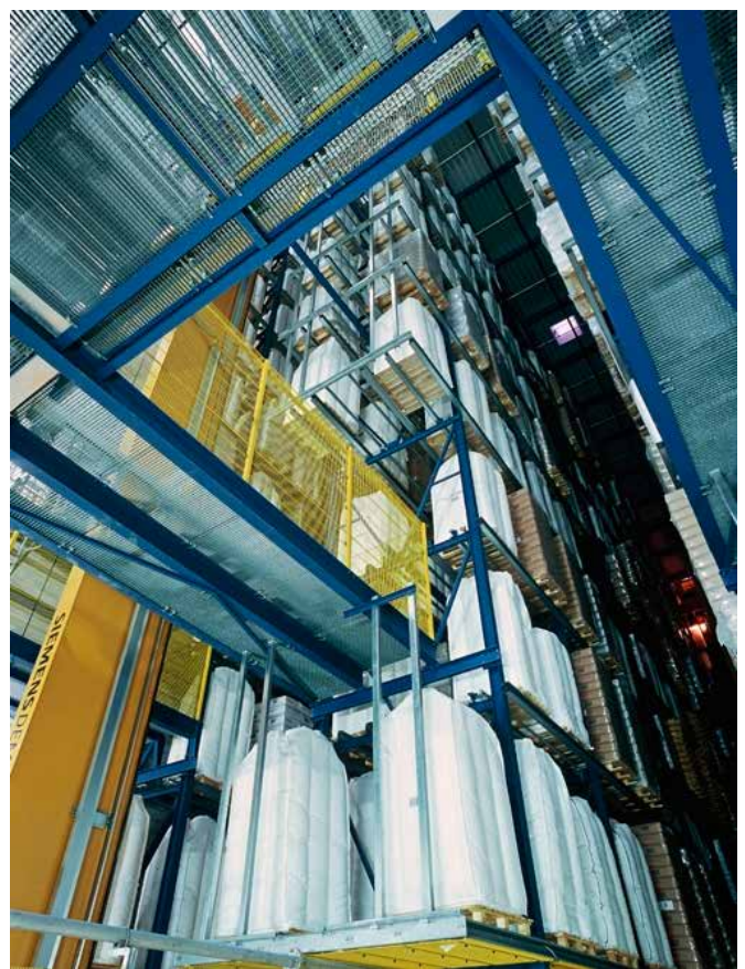
Figure 4 Warehouse with high bay racking to store bags and FIBC

Pallets with bags or FIBCs should not be stacked on top of each other, since the load can increase tamped density and cause compacted agglomerates to form. These compacted agglomerates may cause problems in certain applications. Therefore, it is highly recommended that shelf systems be used to stack pallets above each other. Figure 4 shows a high bay rack system as an example of this.