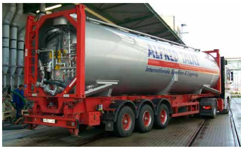
Figure 3 Shipment of AEROSIL® in a silo container